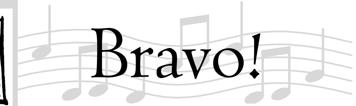
Dedicated to Music Appreciation, Education, Performance—Today & Tomorrow