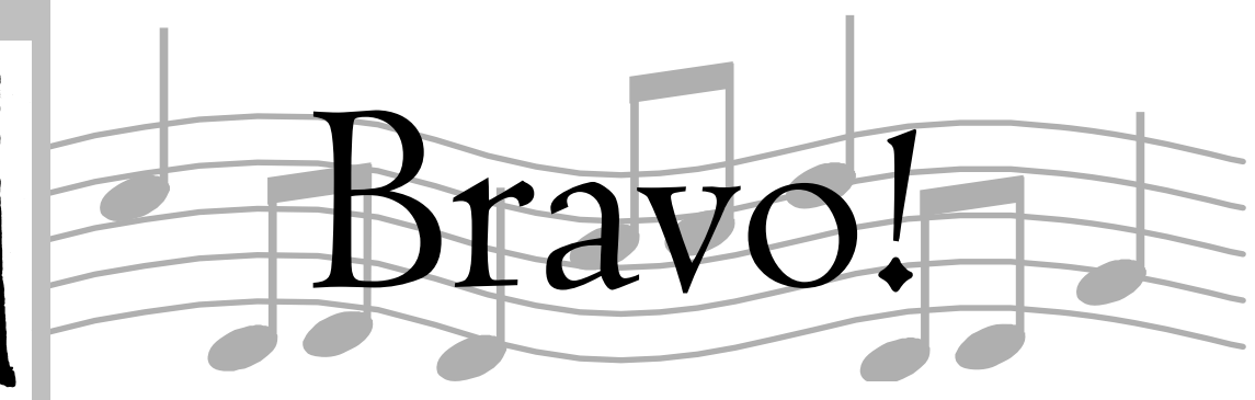
Dedicated to Music Appreciation, Education, Performance—Today & Tomorrow